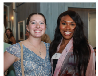
Precious Center volunteers