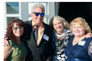
Pro-life sidewalk prayer warriors