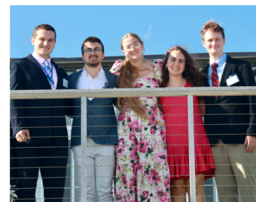
Volunteers from Providence College for Life