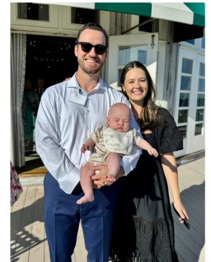
New life! Deep love!