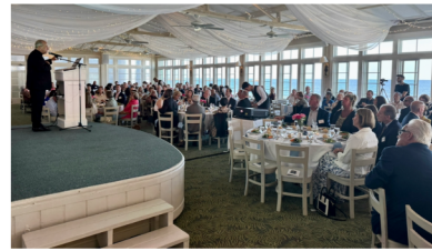
Father Taillon delivering the Invocation

Late September proved to be a wonderful time for a gala! Please join us on Sunday, September 27, 2026.