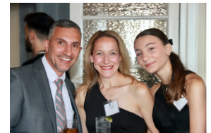
It's all about family!