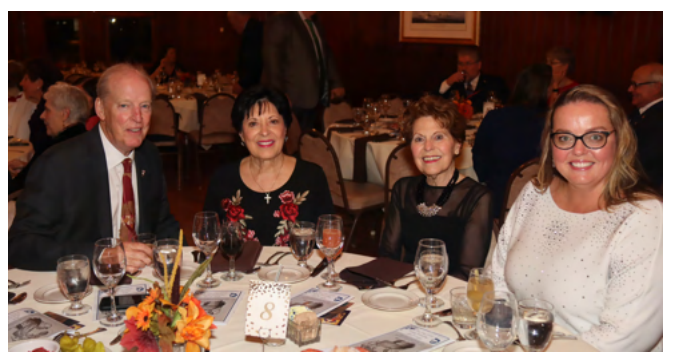
Happy guests at Table 8!