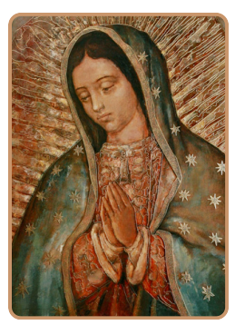
December 12 – The Feast of Our Lady of Guadalupe, Patroness of the Center. Please make a year-end donation in her honor.