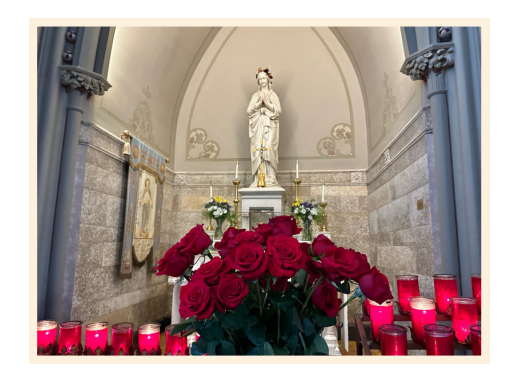
Autumn roses praise the parish patroness at Saint Mary Church, Providence.

We pray for great bouquets of blessings upon everyone who supports the Center through these activities. Thank you all so much!