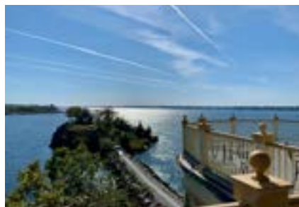
The southward view at Squantum Association.

During the sweet spot of Summer, we will joyfully welcome you to Squantum Association, situated on the scenic east shore of upper Narragansett Bay. You'll enjoy strolling the lovely property, including tiny Huckleberry Island. Lively companions, lapping water, broad and impressive views, and the splendid sunset will furnish a delightful atmosphere.