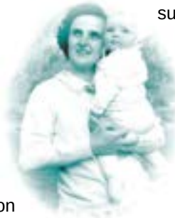
Saint Gianna, pray for us!

Such turnarounds—the saving of babies and souls, are the noble achievements of a variety of mission-driven people functioning in their churches, on the sidewalks,