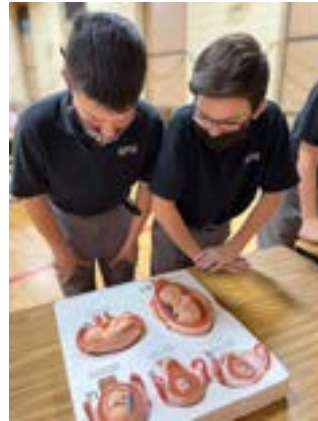
Students examine models of babies at various gestational stages.

Fascinating too, were the students' instincts about holding a baby. Each one cradled the models that they picked up.